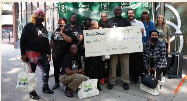
2021 Good Green Grant recipient "Why Not Prosper" in Philadelphia, PA.

Because violations of this Code may damage Green Thumb's reputation, or even be illegal, Green Thumb reserves the right to discipline any personnel who violate this Code, including possible termination of employment.