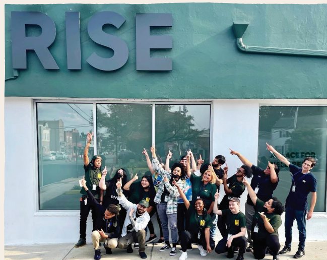
Opening of RISE Bloomfield in New Jersey on September 15, 2021.

Hiring or supervising family members or a person with whom you have a close personal or romantic relationship.